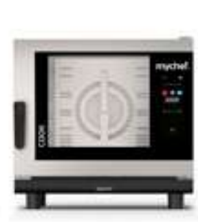
6 GN 1/1 3.277 €