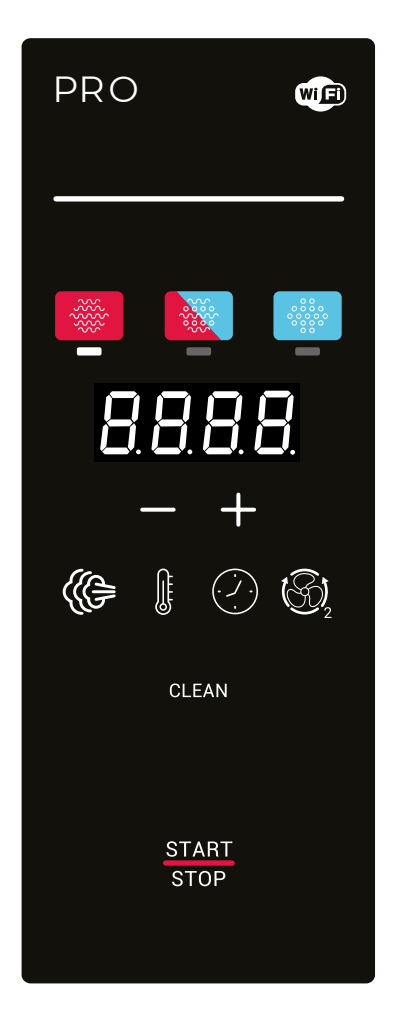
iBAKE BAKE MASTER BAKE PRO