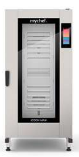
20 GN 1/1 20 GN 2/1