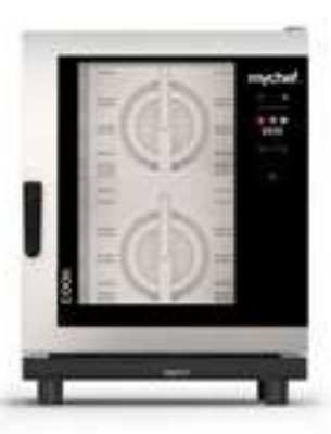
10 GN 1/1 5.147 €