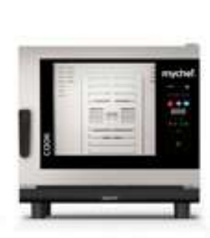
6 GN 1/1 3.853 €