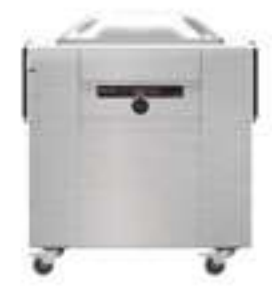
ISENSOR M De pie from 7.884 €