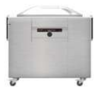
ISENSOR L De pie from 9.544 €