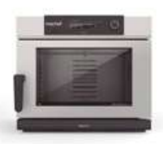
6 GN 1/1 T 5.225€