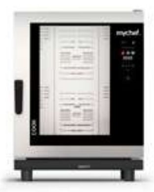
10 GN 1/1 6.180 €