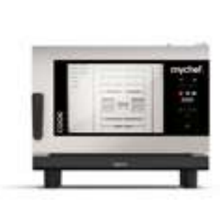
4 GN 1/1 3.255 €