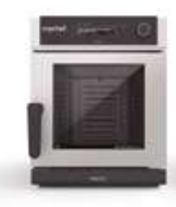
6 GN 2/3 4.747 €