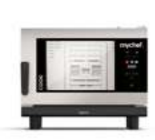
4 GN 1/1 f 3.637 €