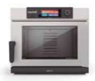
6 GN 1/1 T 6.384€