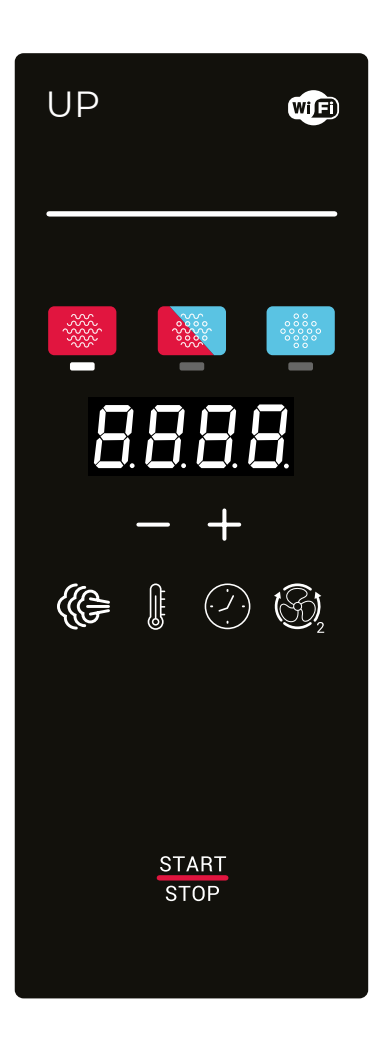
iCOOK COOK MASTER