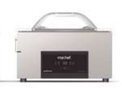
goSENSOR L from 3.730 €