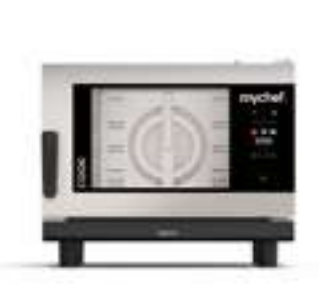
4 GN 1/1 2.725€